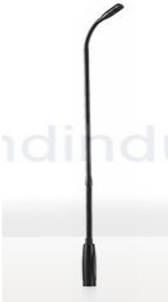
(G) Podium Mic JTS(GM-5218)