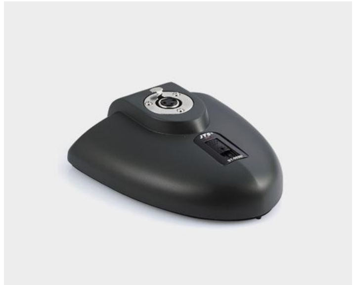
(I) Other Accessories: XLR with cables, Jacks and Spokons(Hawk/Ugreen makes)